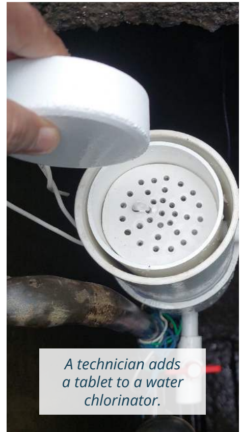
A technician adds a tablet to a water chlorinator.

Because of Self-Help, the people of El Jícaro now feel that they have the tools and knowledge to manage their own safe drinking water.