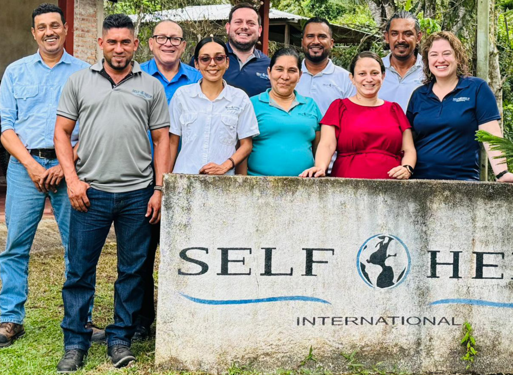
Self-Help International's Nicaragua staff, January 2026